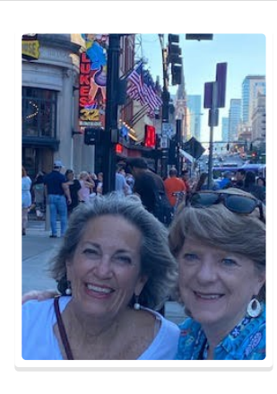
We can always