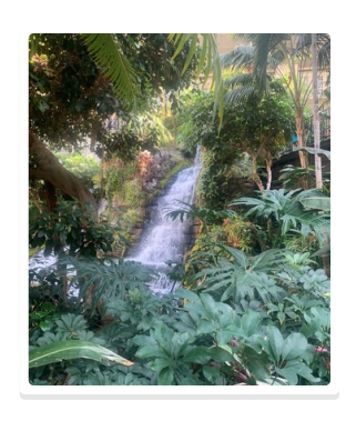
We stayed in the